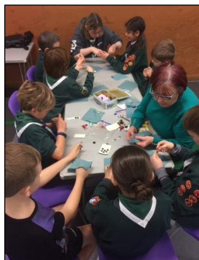
What a busy bunch you are in Yellow Pack (Ed)