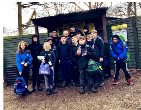
Birds Leadership Team